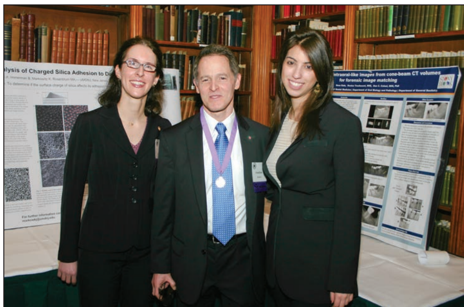
Research project from Stony Brook University College of Dental Medicine

Forensic identification relies often on the comparison of post mortem radiographs to any ante mortem images made available to the forensic specialist. Ante mortem images are usually conventional intraoral radiographs taken by the presumed patient's dentist. These must be compared to similar images of the cadaver. Making intraoral images on the cadaver is associated with inherent obstacles related to the body's decomposition status,