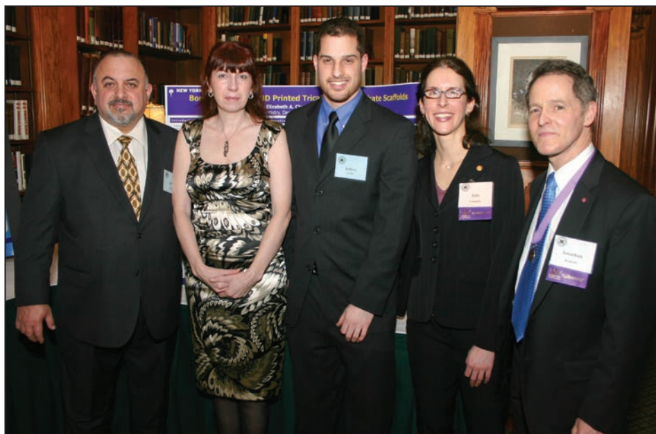
Research Project from New York University College of Dentistry

Results and Conclusions: Scaffold volume was designed to vary by ring section. Bone volume was higher in the more open, less scaffold-dense areas. Pores ranged from around 100 to 940 microns. Bone grew into all varied height layers, but appeared to take longer to get through largest pore sizes. Contrary to previous literature findings, pores larger than 500 microns still filled well with bone.