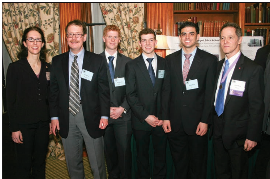
Research Project from University of Medicine and Dentistry of New Jersey, New Jersey College of Dentistry

Conclusion: With reference to the SEM images, the NH 2 charged particles adhered to the dentinal tubules intratubularly more effectively than the COOH or OH particles, which seemed to coat the intertubular spaces predominantly. Therefore, it can be predicted that NH 2 beads are desirable particles in an anti-inflammatory drug system delivered to the dental pulp following dental caries preparations.