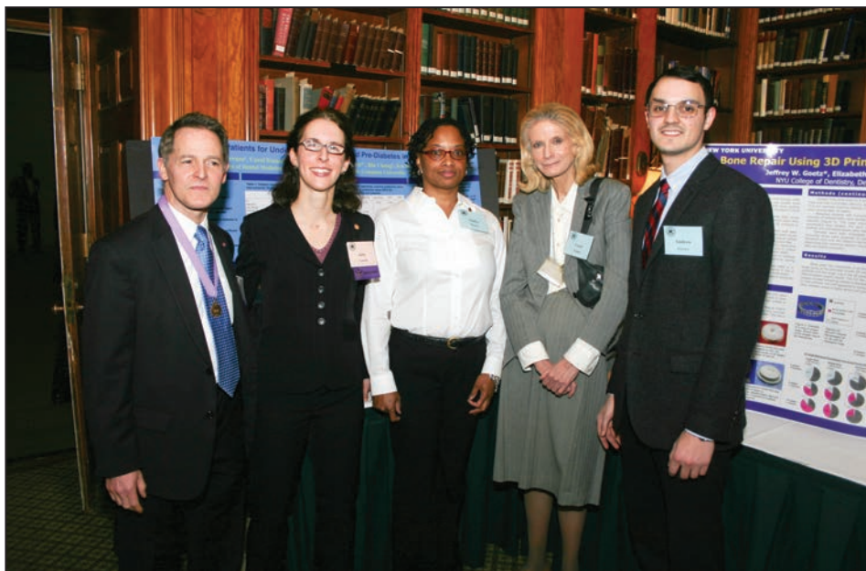
Research Project from Columbia University School of Dental Medicine